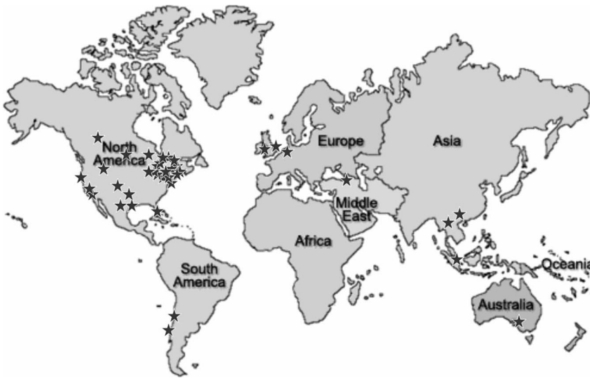
Figure 1. Centers participating in the IPSS group as of July 1, 2007.

(gestational age \geq 37 weeks) and 19 years of age from January 1, 2003, to July 1, /2007, at a participating IPSS center and provided consent (Figure 2). The IPSS defined ischemic stroke as focal ischemic brain injury due to obstruction of either arterial or venous blood flow, and hence included both AIS and CSVT. Patients with CSVT were included whether or not there was parenchymal injury. Data on children who presented after the perinatal period with infarctions that were presumed to occur in the perinatal period 4 were collected but not included in this analysis because the exact time of infarction could not be confirmed. Other childhood cerebrovascular disorders excluded from the IPSS were transient ischemic attacks without infarction, primary intracranial hemorrhage, metabolic infarction in a nonvascular territory (eg, MELAS), hypotensive watershed injury, periventricular leukomalacia, or reversible hypertensive leukoencephalopathy.